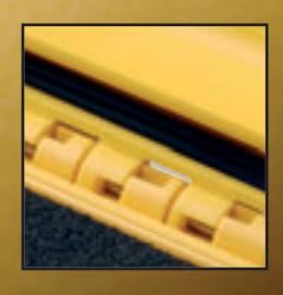
Aviation Tool Box